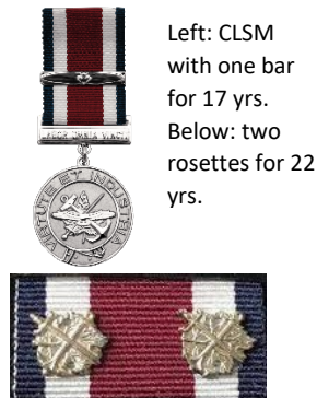
Left: CLSM with one bar for 17 yrs. Below: two rosettes for 22 yrs.

CLSM Five-Year Service Bars and Rosettes. A five-year bar is awarded at 17 years, 22 years and 27 years of Commissionaires service. At 32 years the three silver bars are replaced by one gold bar. Five-year bars continue to 37 years and even 42. On the uniform undress ribbon the bars are represented by rosettes.